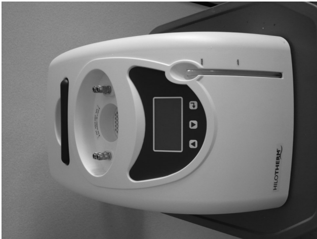
FIGURE 1. Thermostatic control.