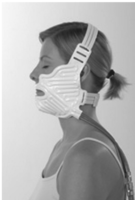
FIGURE 5. Mask application modality (lateral view).

time and related to cutaneous area, there is an increase of muscular tone for \alpha -motoneuron stimulation by cutaneous receptors. For long application time, there will be muscular tone reduction. 2