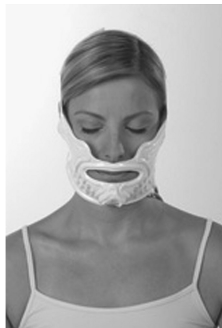
FIGURE 4. Mask application modality (frontal view).