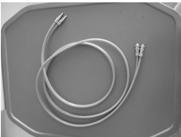
FIGURE 2. Pipes connection.

cryotherapy decreases biochemical reactions in the time unit, consequently slowing down cell metabolism. The first modification in vascular system consists of surface vessel constriction, followed by a reflex systemic vasoconstriction. The vasoconstriction increases at most at 15°C. When cutaneous temperature goes down 15°C, there is a paradox vasodilatation attributable to a paralysis of vascular smooth musculature or nervous conduction block of vasoconstrictive nervous fibers. This vasodilatation is a defense mechanism, to preserve blood flow at low temperature. Low temperature slows down peripheral nerve conduction. It has been proven that a 1° reduction in temperature causes 2.4-m/s reduction in peripheral nerve conduction, and at 10°C to 15°C, the nervous conduction is abolished completely. The effect of cryotherapy on muscles is related to the application time. If temperature reduction is limited in